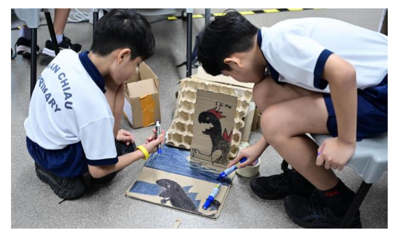
Caption: Participants put their heads together to come up with exciting prototypes.