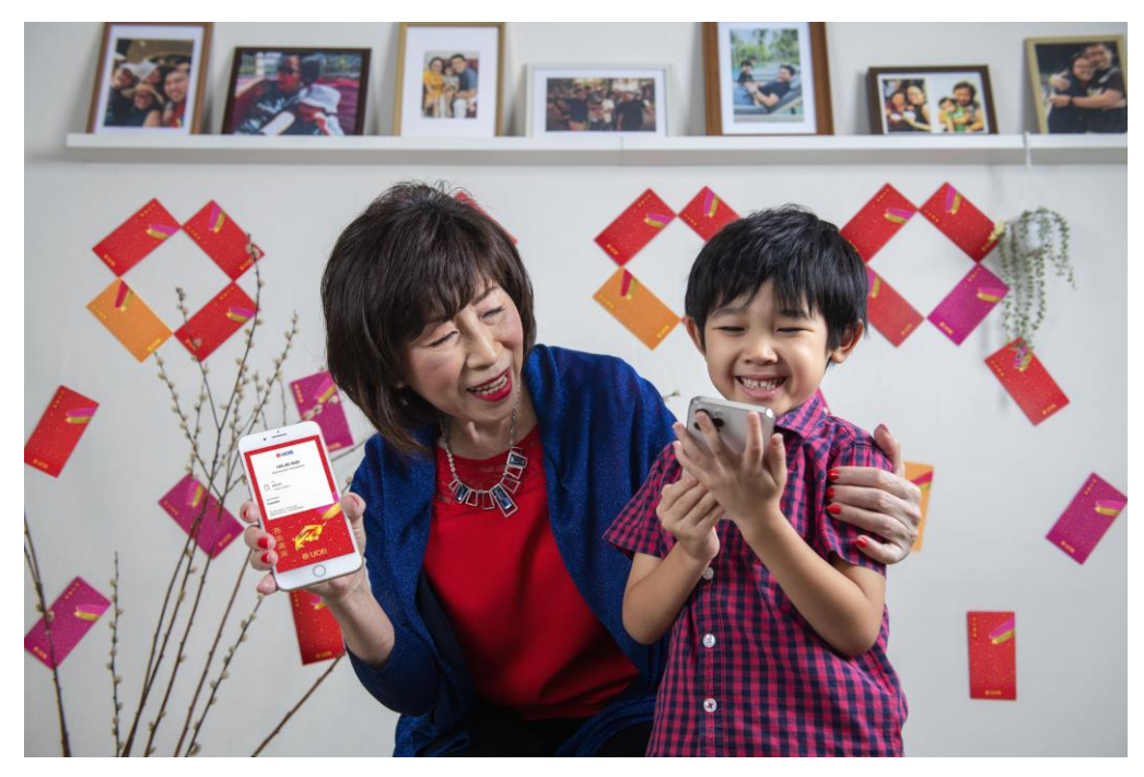
In just five steps, UOB customers can send an auspicious e-hongbao safely to their loved ones through UOB Mighty

Lunar New Year programme reinforces the Bank's commitment to forging a sustainable future for all