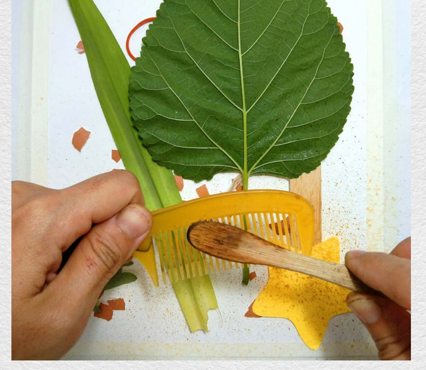
Create a splattering paint effect by brushing the toothbrush against the teeth of the comb.