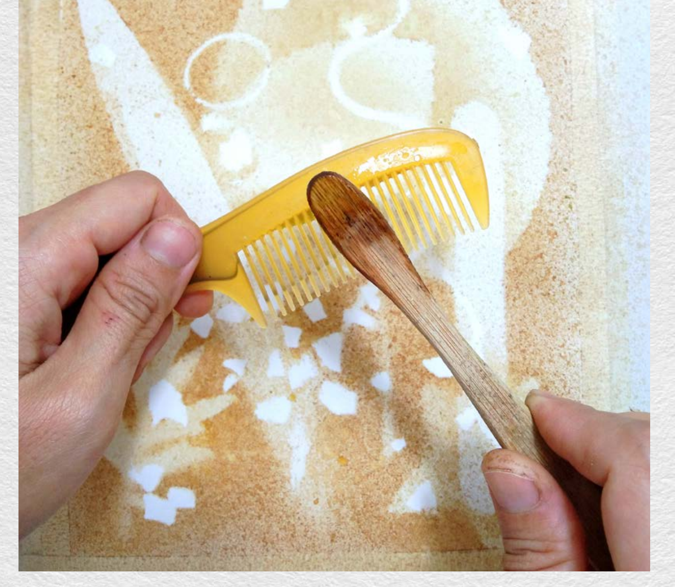
Remove the crushed eggshells. Dip the toothbrush in the beetroot dye. Splatter the dye in the centre of the artwork.