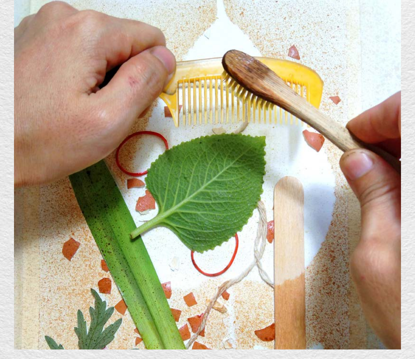
Remove the mulberry leaf and star shaped paper. Splatter the white areas with the red onion dye.