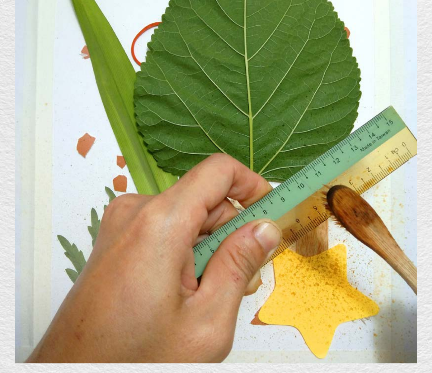
You may also use a plastic ruler to splatter the coffee dye.