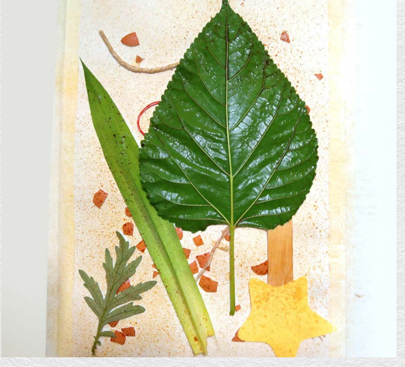
Splatter across the paper until it is evenly covered with the coffee dye.