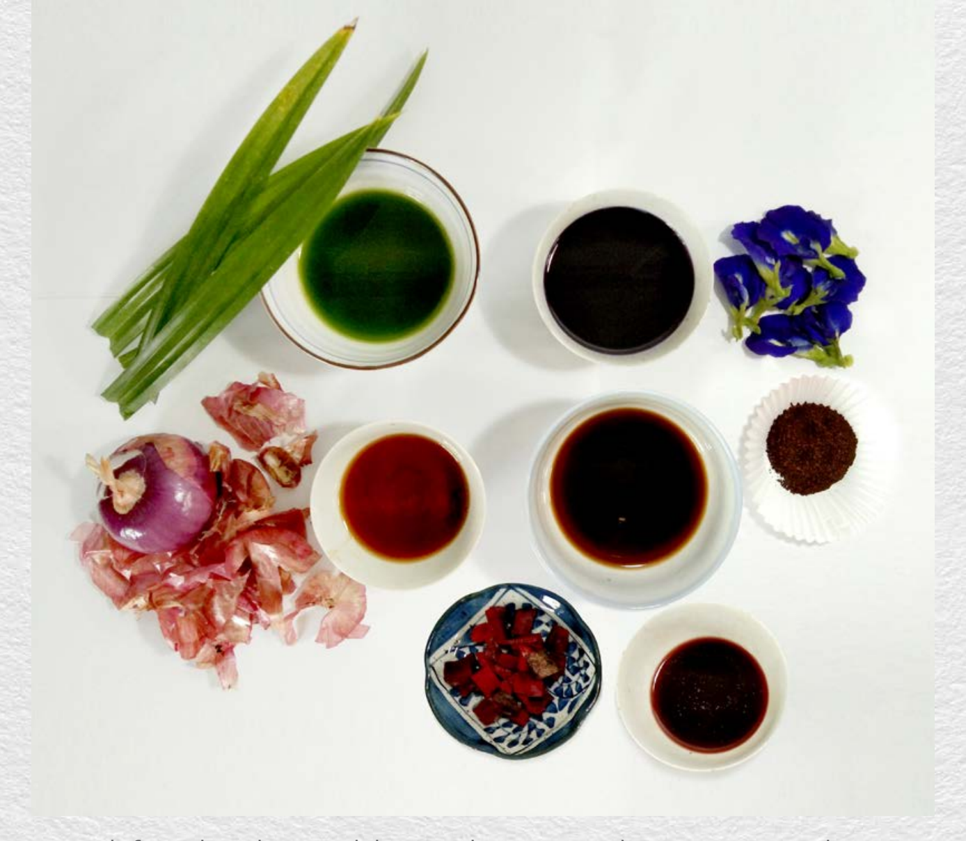
Materials for making the natural dyes: Pandan Leaves, Red Onion, Beetroot, Blue Pea Flowers and Black Coffee Powder