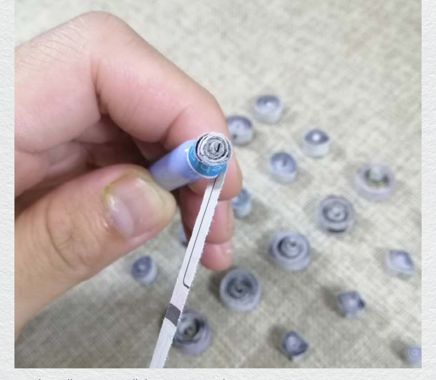
Use the quilling pen to roll the strips into coils.