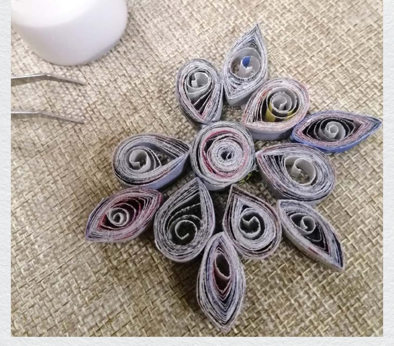
Stick the eye shaped coils between the teardrop shaped coils.