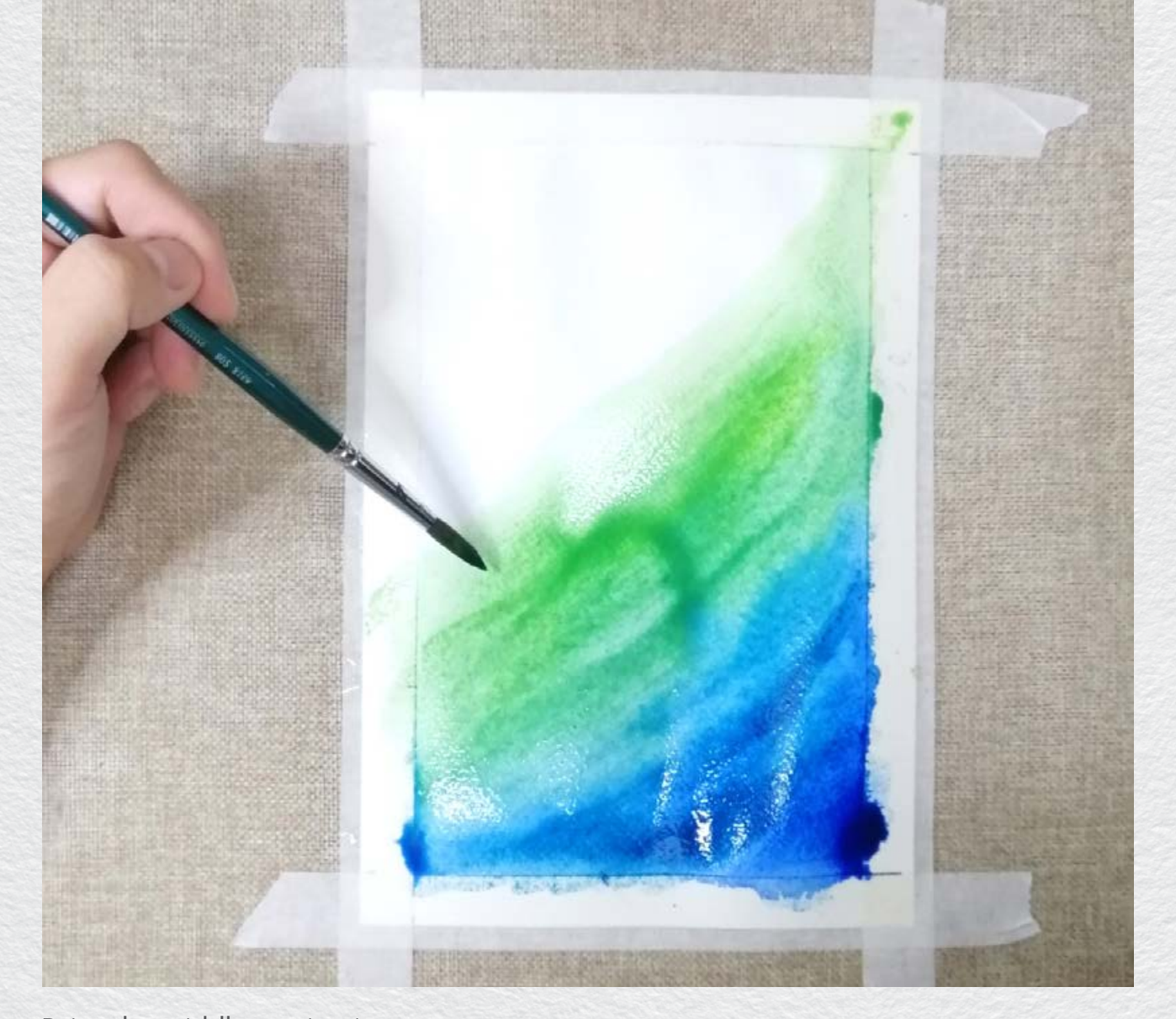
Paint the middle section in green.