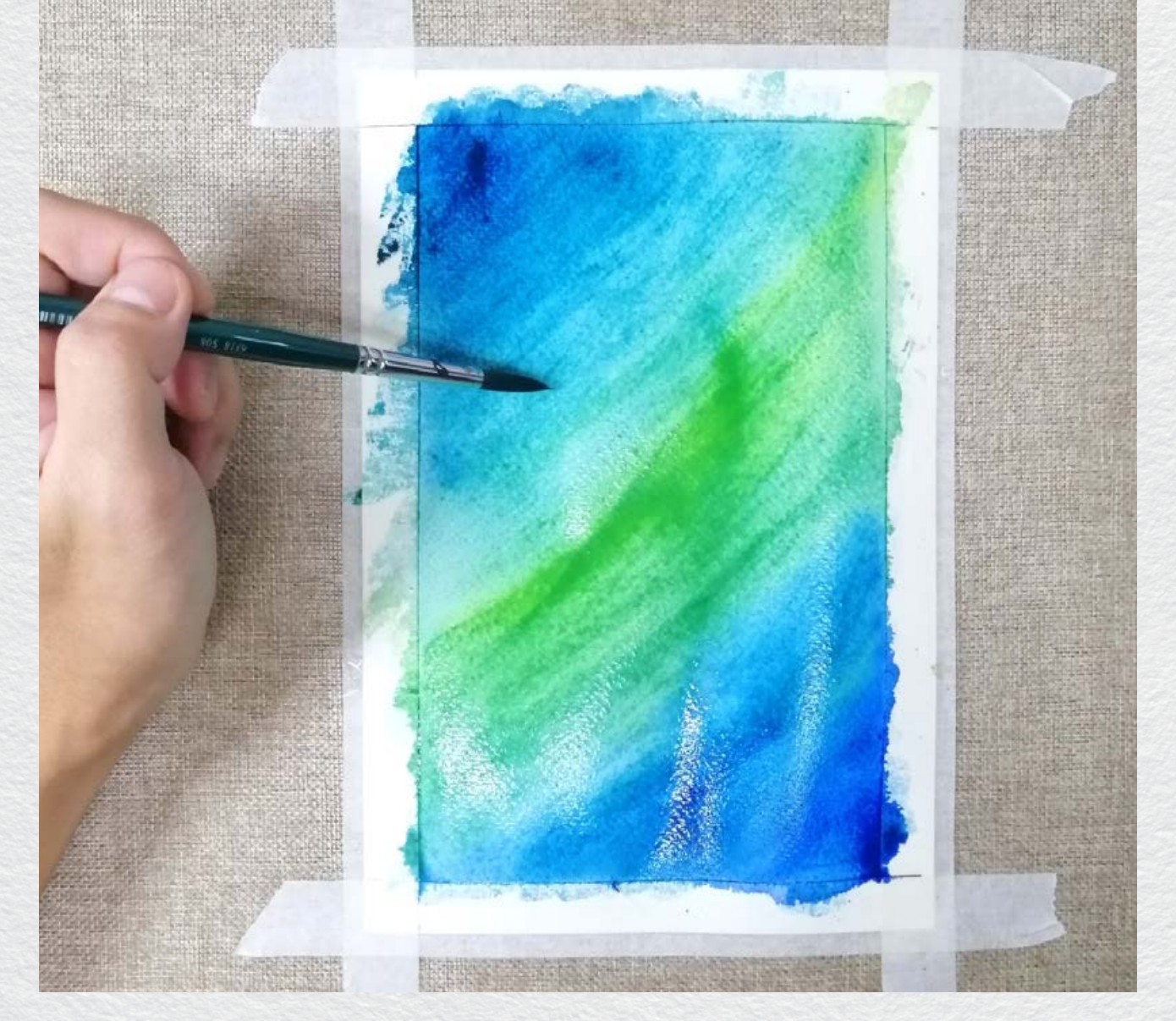
Paint the top section in blue. Create a gradient effect by overlapping blue on green at the edges.