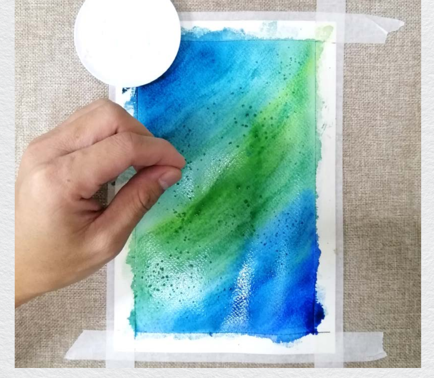
Sprinkle salt and wait for the paint to dry.