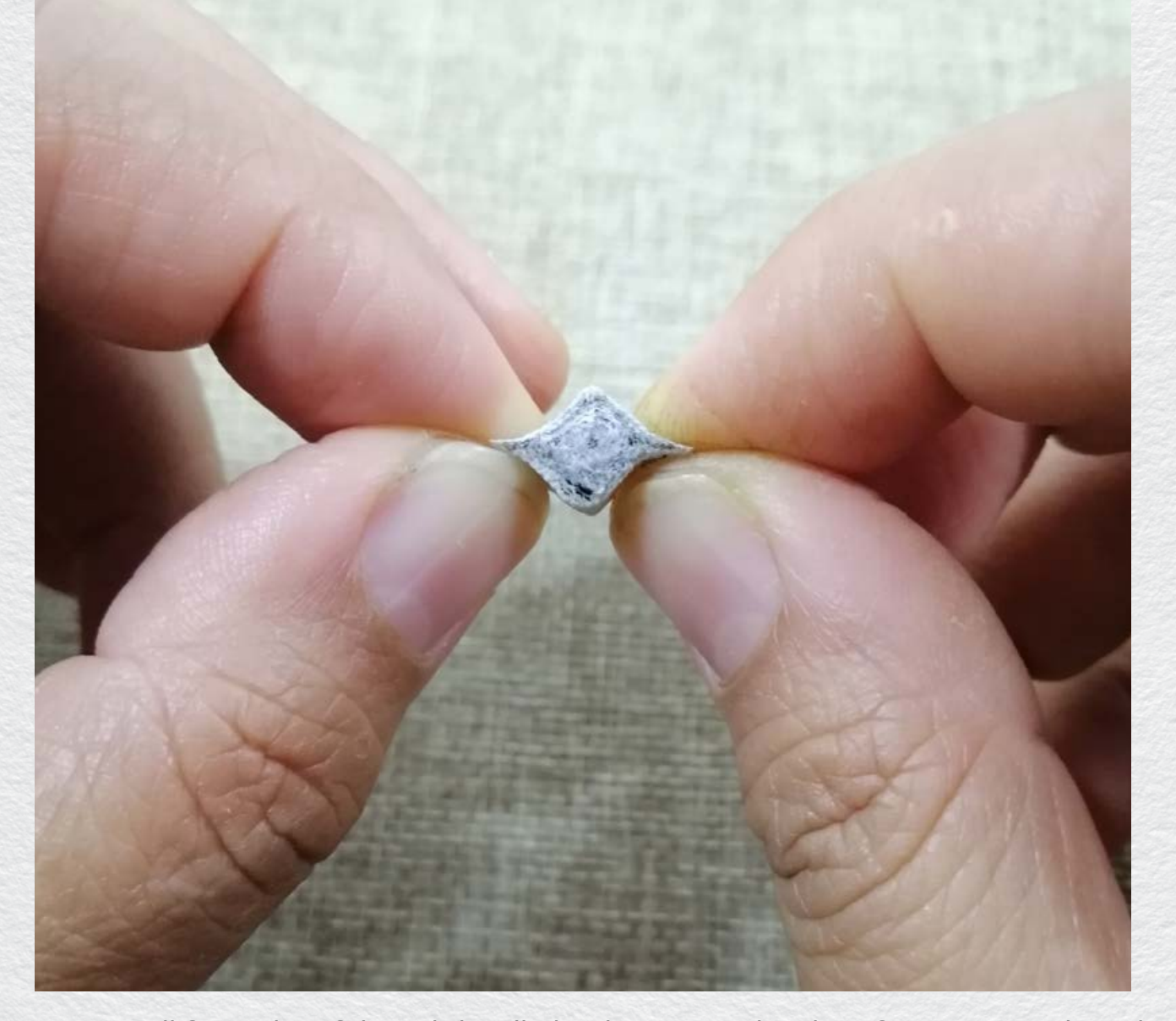
Squeeze all four sides of the tightly rolled coil using your hands to form a square shaped coil. Create six square shaped coils.