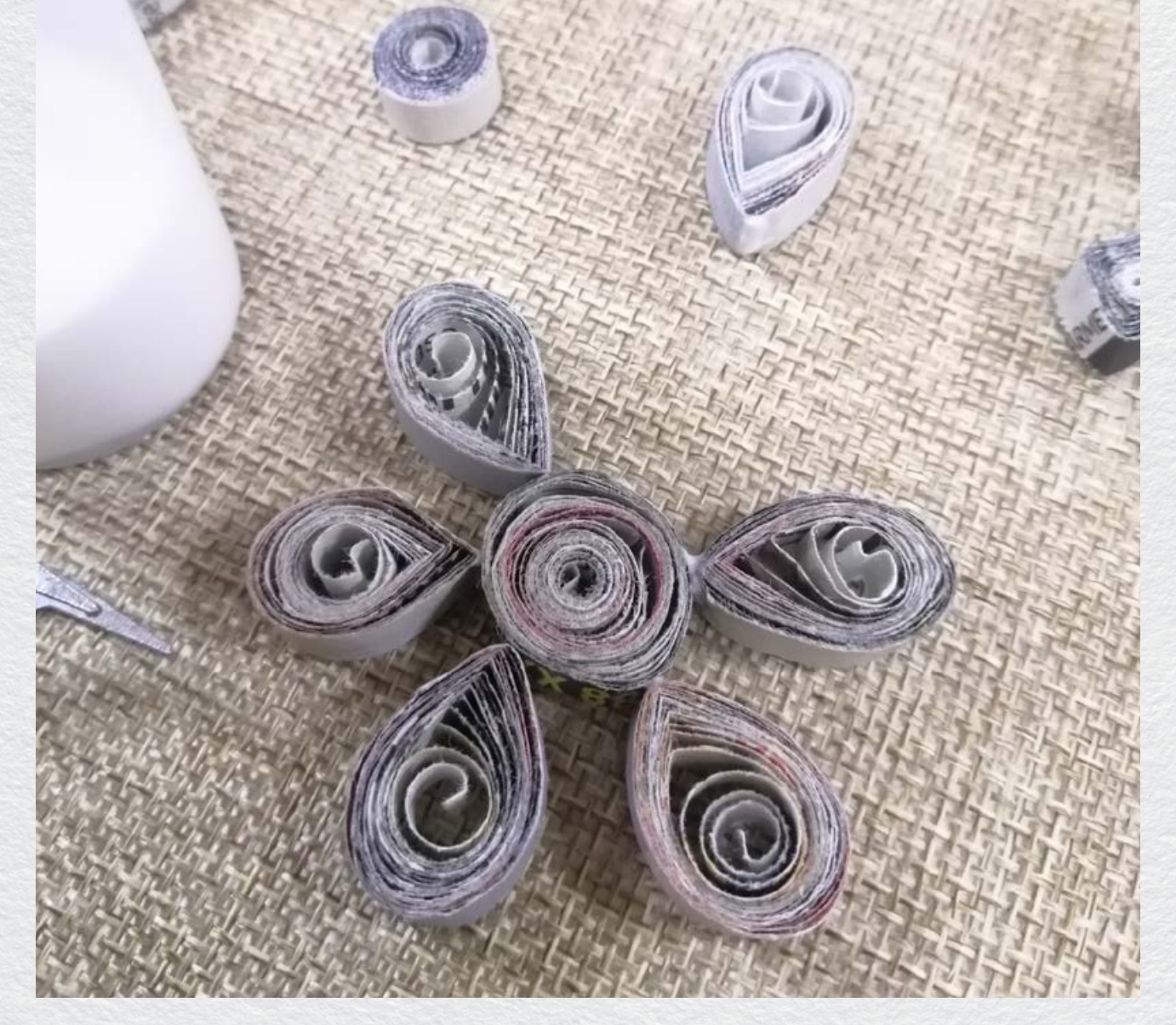
Glue the teardrop shaped coils to a loosely rolled coil. Leave a gap between each coil.