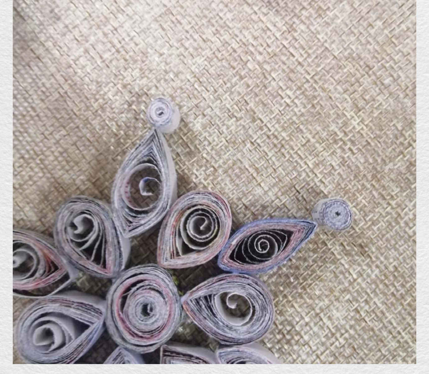
Stick the tightly rolled coils to the tip of the eye shaped coils.