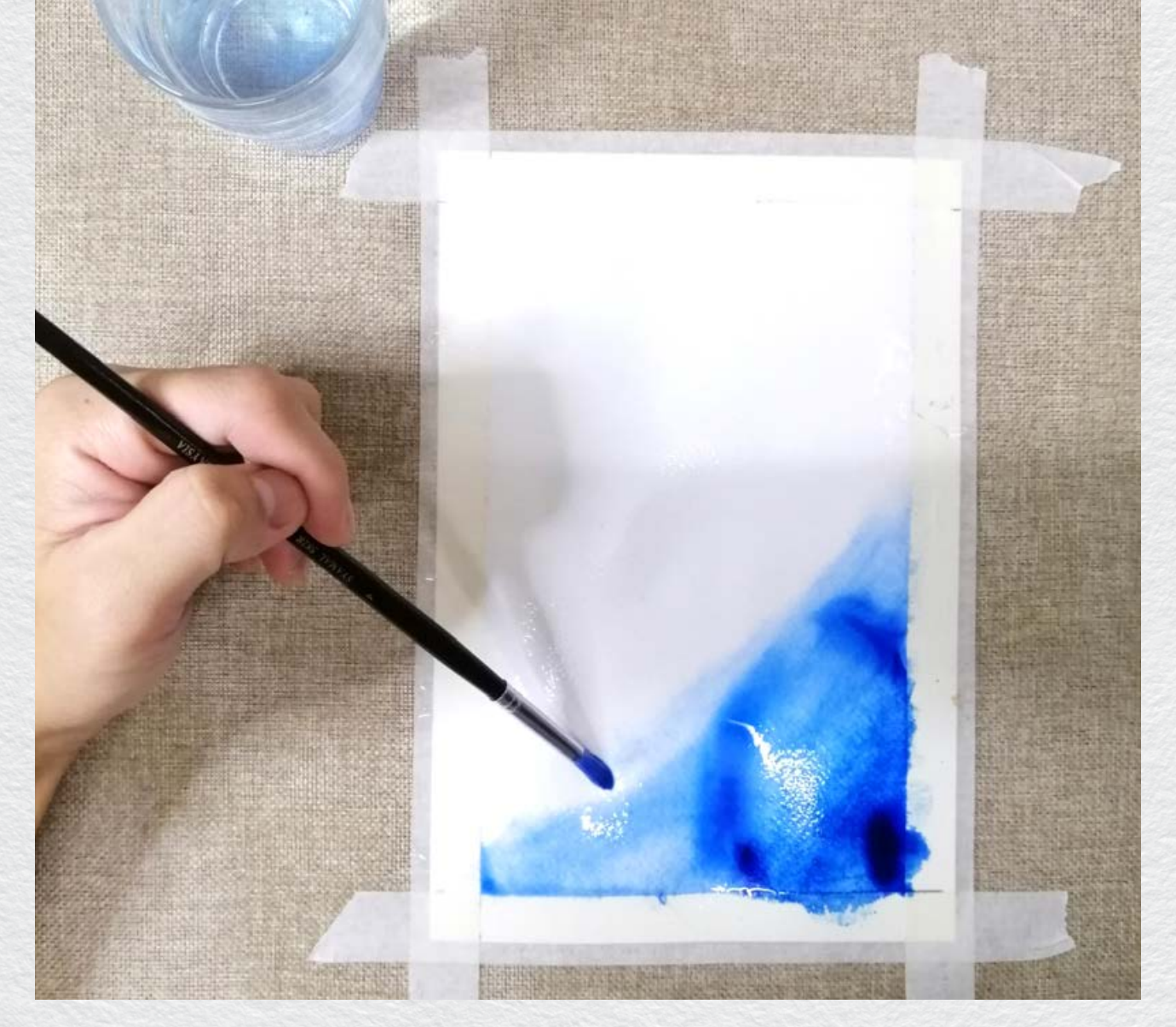
Paint one-third of the paper in blue.