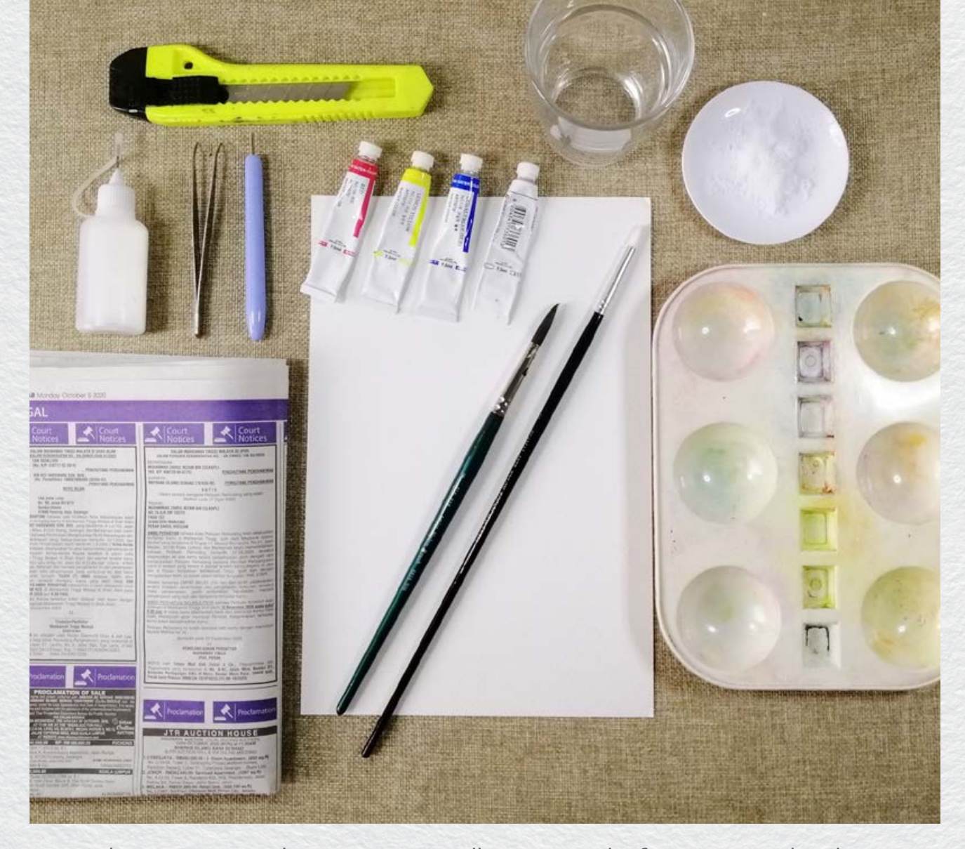
Materials: Newspaper, Glue, Tweezers, Quilling Pen, Penknife, Paper, Paintbrushes, Watercolours, Palette, Water and Salt