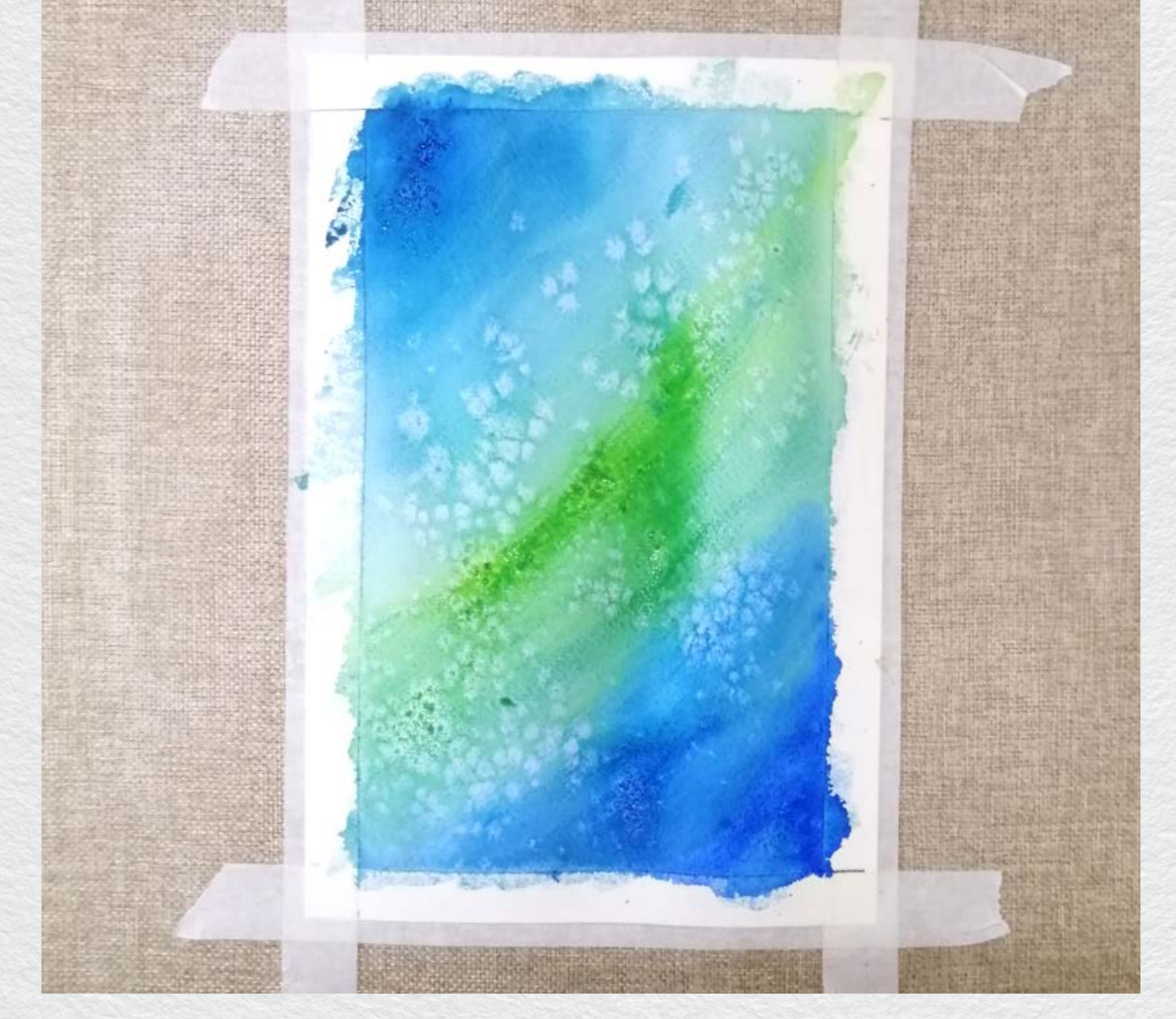
You will get a snowing effect after the paint has dried.