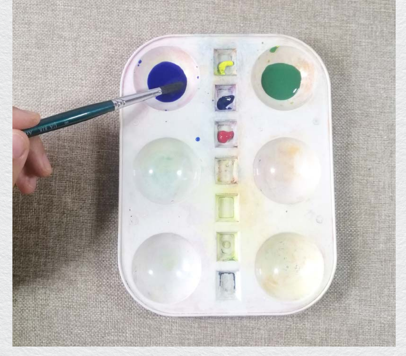
Prepare the watercolours.