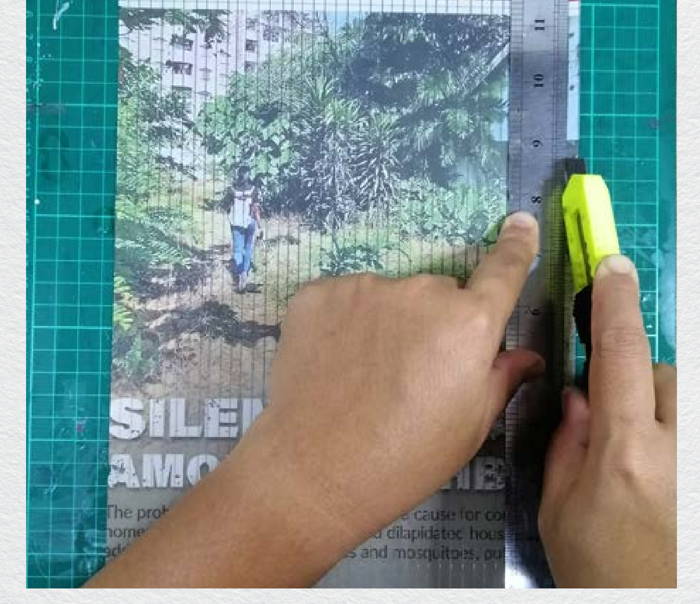
Cut newspaper into strips of 30cm length and 0.5cm width.