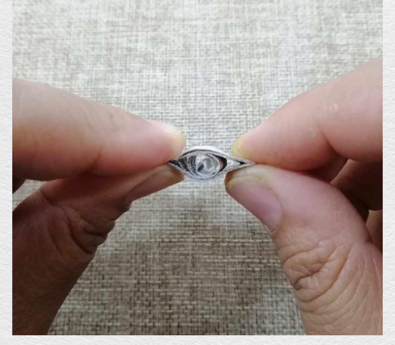
Squeeze both sides of the loosely rolled coil using your hands to form an eye shaped coil. Create six eye shaped coils.