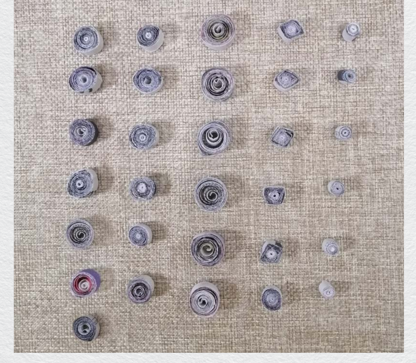
Create 19 loosely rolled coils, including one to be used as the centre of the snowflake and 12 tightly rolled coils. Roll the strips tighter to create the tightly rolled coils.