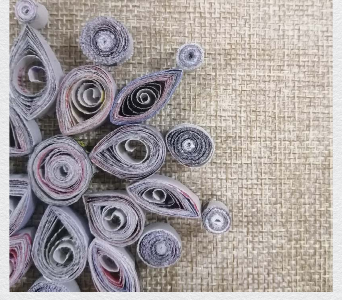
Stick the loosely rolled coils to the tip of the teardrop shaped coils.