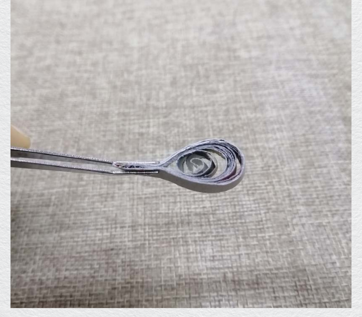
Pinch the loosely rolled coil using a pair of tweezers to form a teardrop shaped coil. Create six teardrop shaped coils.