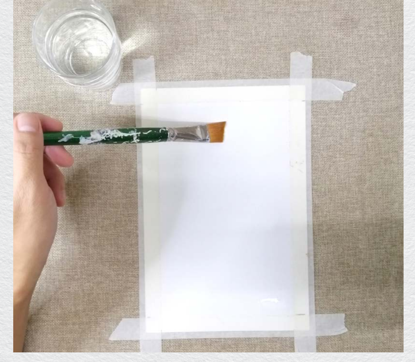
Tape the sides of the paper.