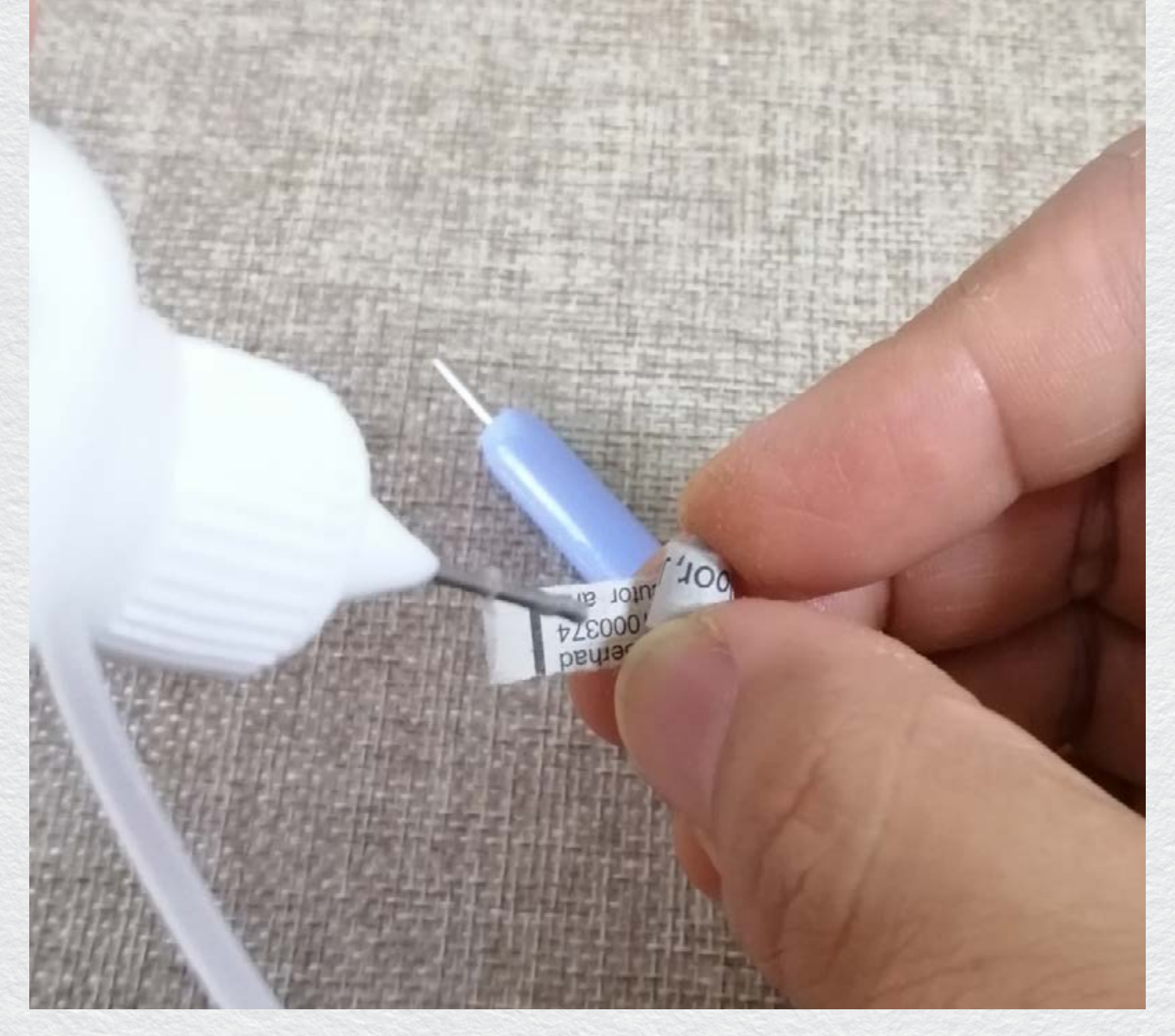
Complete the coil by applying glue at the end of the strip.