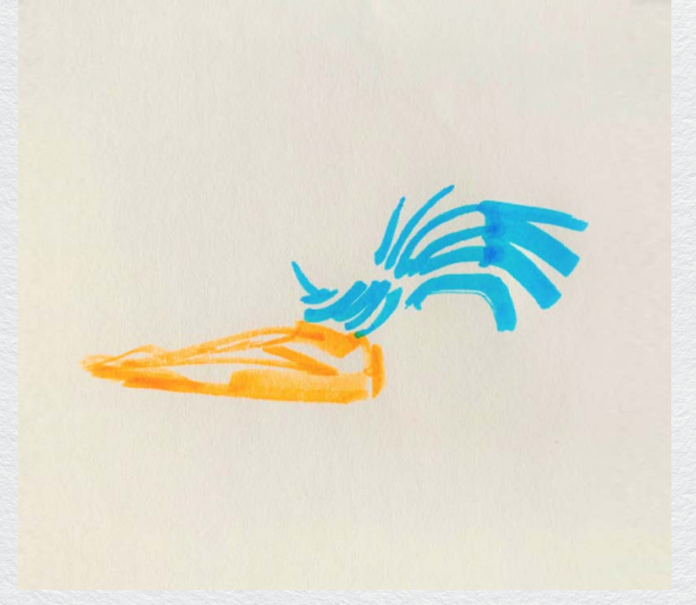
Shape the head using a blue highlighter.