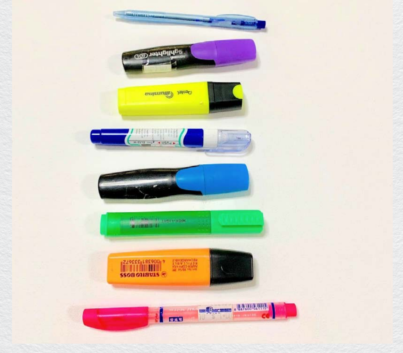
Materials: Drawing Paper, Highlighters, Ballpoint Pens and Correction Fluid