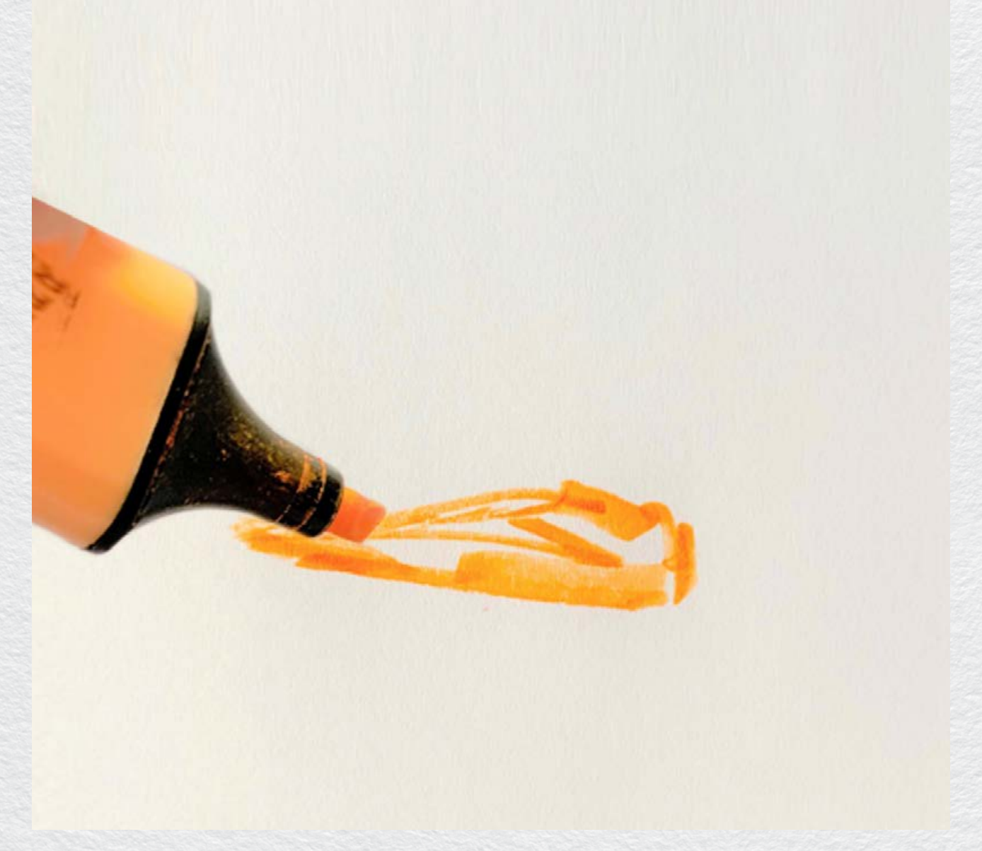
Start by mark-making the beak of the bird with an orange highlighter.