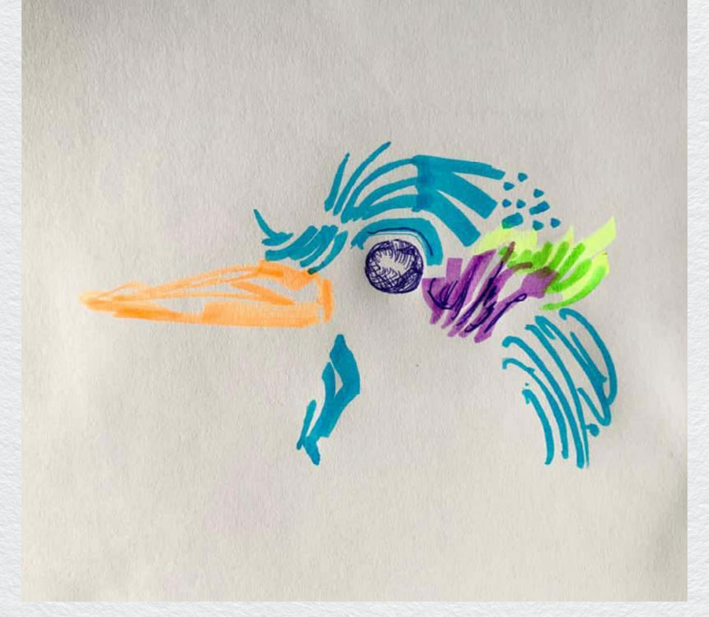
Draw the upper body of the bird in strokes using blue, green and yellow highlighters.