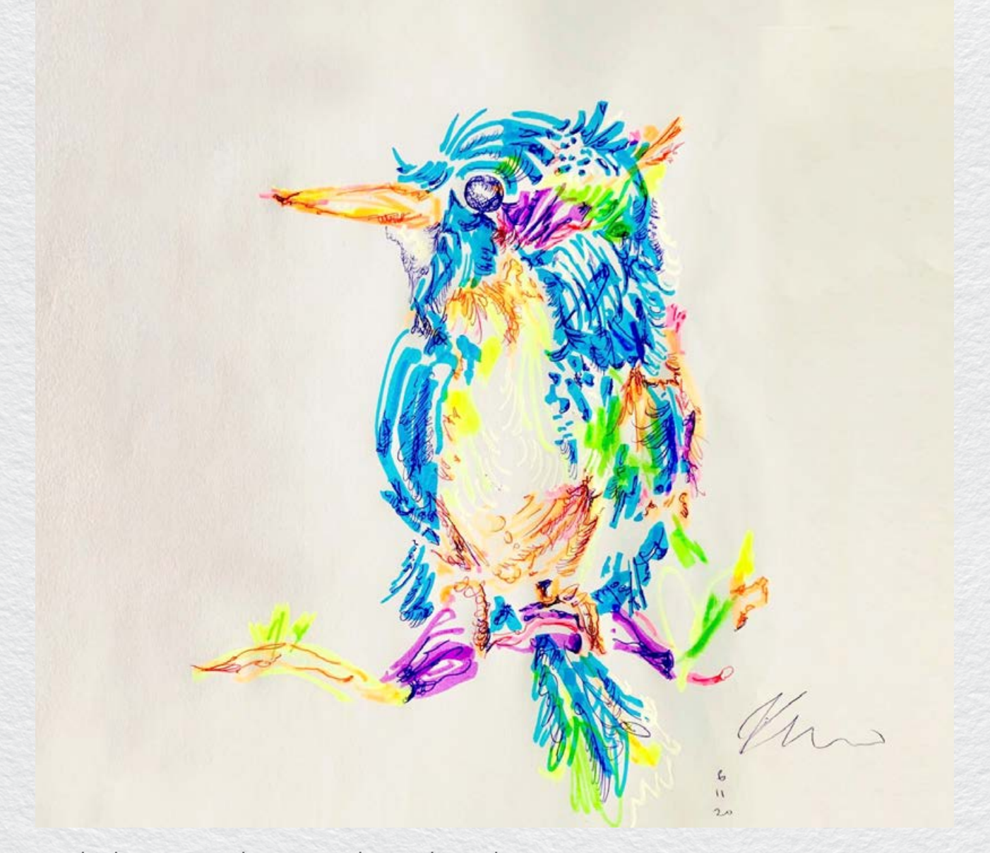
Apply the same technique to draw other subject.