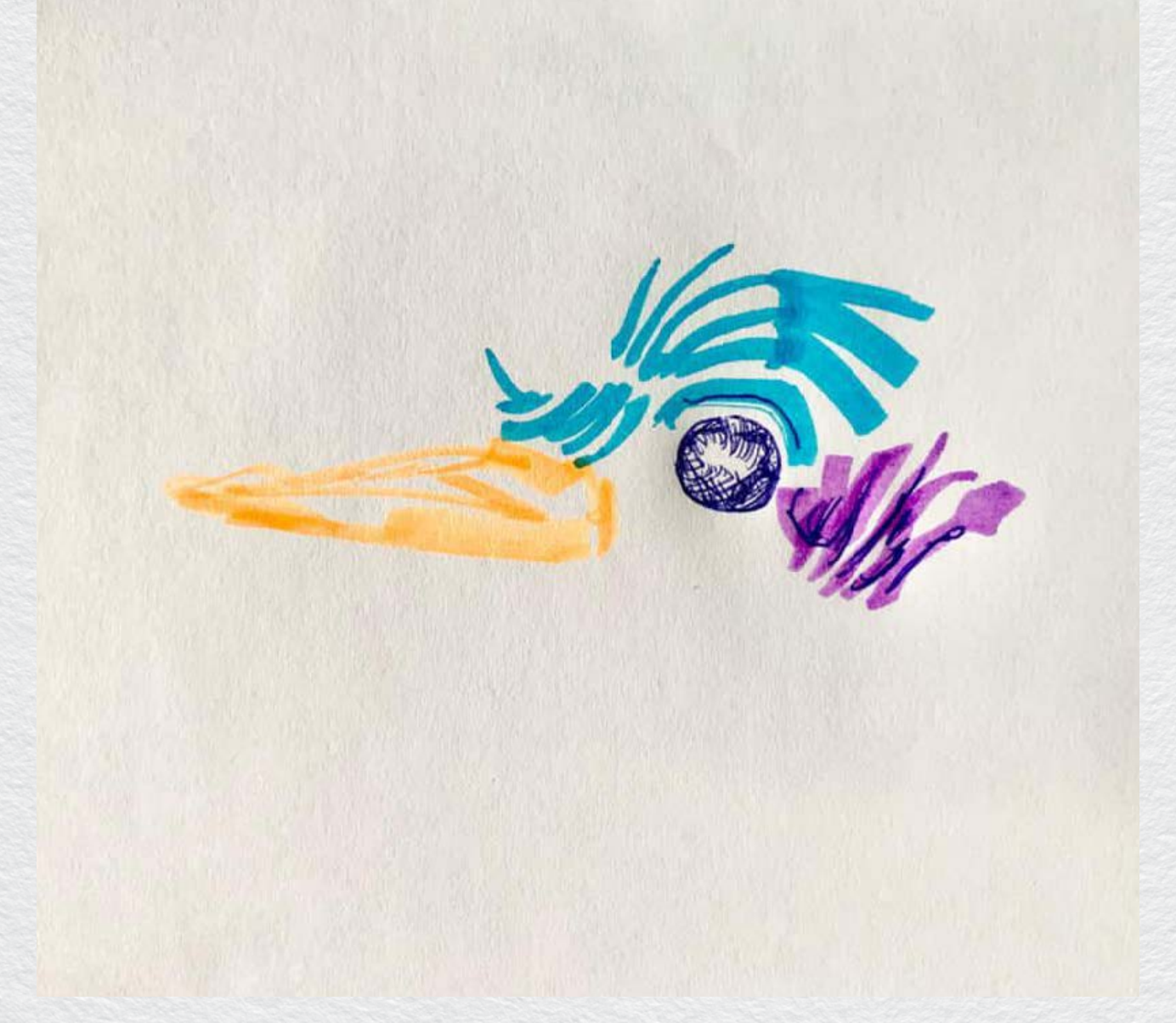
Add details to the eye and feathers using a blue pen.