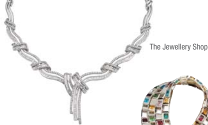
The Jewellery Shop