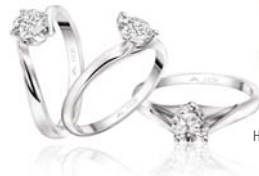
Hearts On Fire®

Look forward to fabulous jewellery deals throughout the festival.