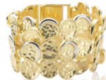
OR022™ by Poh Heng