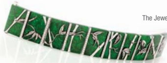
The Jewel Box