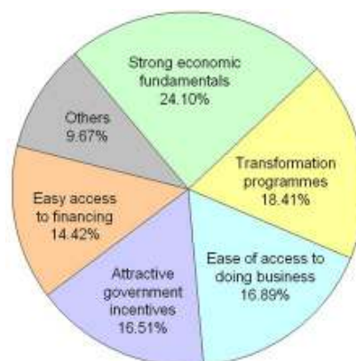
Chart 1: Factors facilitating SME growth

SME respondents in Malaysia said that their confidence in the medium-term growth potential for the SME sector was supported by strong economic fundamentals (24 per cent), the Malaysia Government's Transformation Programmes 2 (18 per cent) and the ease of access to doing business (17 per cent).