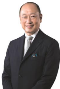
Mr. Wee Ee Cheong, Deputy Chairman and Chief Executive Officer, UOB

“ The global economy remains uncertain and recent geopolitical tensions have added to market volatilities. At UOB, we have a resilient portfolio that allows us to ride through market cycles. Our core businesses performed well, with higher net interest income and record credit card fees.